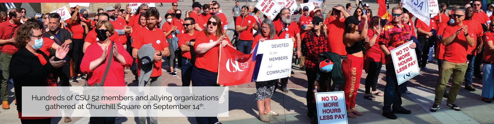
Hundreds of CSU 52 members and allying organizations gathered at Churchill Square on September 14 th .

A campaign to support negotiations for both the City of Edmonton and Edmonton Public Library bargaining units began over the summer. CSU 52 started by organizing people to be Red Shirt Captains in their work areas. Our captains have been busy organizing the membership about our collective actions ever since.